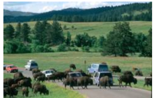
Bison along the eastern edge of the Park, where undeveloped private land nears the Wildlife Loop.

Custer State Park: GFP continues negotiations with landowners along the eastern edge of the Park to purchase or secure donations of scenic conservation easements that will preserve scenic vistas along the Park road system. These easements will protect the wide open spaces that are home to many species of wildlife, including herds of Bison, from neighboring development. The Foundation will begin to gather funds to support this effort in 2010.