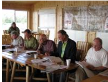
Board members deliberate during a recent meeting near Pierre. Meetings are held several times a year across the State.