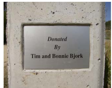
A Milepost plaque

Send coupon below to: Milepost Markers, Black Hills Trail Office GFP, 11361 Nevada Gulch Rd, Lead, SD 57754