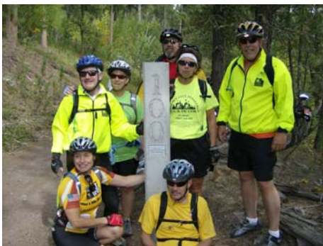
Members of the Capital City Bicycle Club and the Milepost they donated

Purchase a Marker now and the South Dakota Parks and Wildlife Foundation will enroll you as a Friend of Parks and Wildlife 2010 at no additional charge. In addition to your tax receipt, you'll receive a free year's subscription to the GFP's Conservation Digest and a "Friend" sticker for your car window.